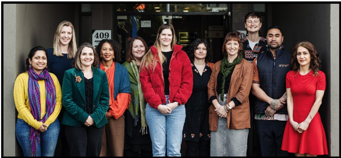
The Shine Training and Education Team

Shine Training & Education Programmes align with the E2E Family Violence Capability Framework and are informed by conceptual frameworks including family violence as a form of social entrapment , Response Based Practice (victim-survivors resist violence and the social context matters), and wellbeing frameworks such as Kaupapa Māori models of wellbeing (e.g. Te Whare Tapa Whā , Te Wheke).